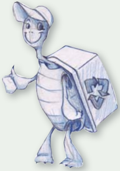
Ertle the Turtle Leawood's Recycling Mascot

"Growing Green Together" is the Vision Statement chosen by the Green Initiative Citizen Task Force. The task force, a newly formed Committee in 2008, consists of members appointed by the Mayor of Leawood. The committee's mission - - to lead, motivate, and collaborate with Leawood citizens, to increase recycling, encourage energy conservation, and promote "green" mobility options in the City of Leawood.